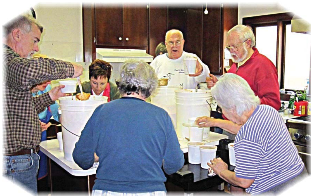
Gumbo Preparation - Finale