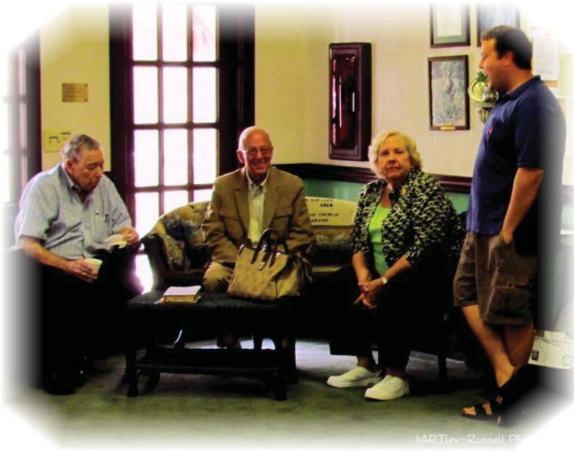
hARTley - Russell Photography