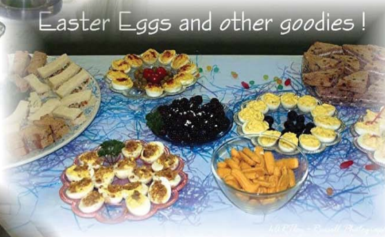
Easter Eggs and other goodies!