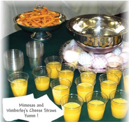
Mimosas and Wimberley's Cheese Straws Yumm!