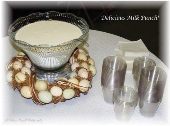
Delicious Milk Punch!