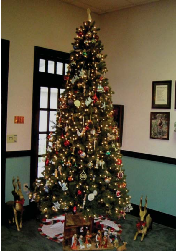
Christmas Tree Wilkens Hall 2010