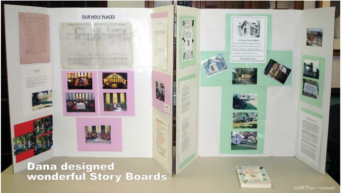
Dana designed wonderful Story Boards