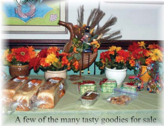
A few of the many tasty goodies for sale