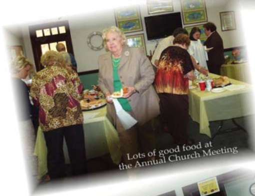
Lots of good food at the Annual Church Meeting