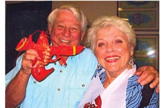
Mmmmm.... Lobster Good!!